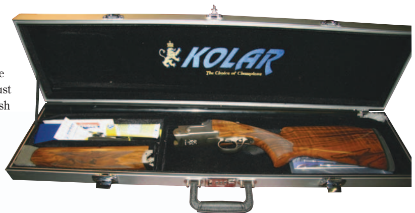
LEFT: COMPLETE TRIGGER ASSEMBLY IS EASILY REMOVED. COILED SPRINGS POWER THE HAMMERS. NOTE THE BARREL SELECTOR TAB JUST BEHIND THE TRIGGER. ABOVE: ALUMINIUM AIRLINE APPROVED HARD CASE.