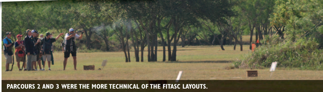
PARCOURS 2 AND 3 WERE THE MORE TECHNICAL OF THE FITASC LAYOUTS.