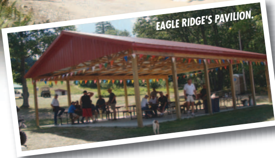
EAGLE RIDGE'S PAVILION.

BECAUSE THE CLUB IS IN A HIGH SNOW AREA, THEY ADJUST THE COURSE DURING THE WINTER BY CLOSING THE HIGHEST ELEVATION STATIONS AND RELOCATING SOME TRAPS TO SHORTEN THE WALKING DISTANCE.