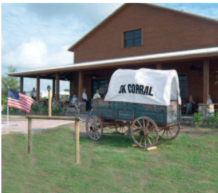
ABOVE: CLUBHOUSE EXTERIOR.

(OK Corral Gun Club, 6341 NE 96th Ave., Okeechobee, FL 34972)