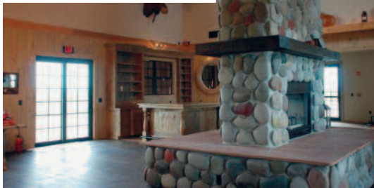
RIGHT: CLUBHOUSE INTERIOR.