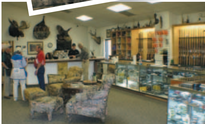
TOP: SPECTACULAR TARGETS UNDER THE SHADE OF ONE OF THE MANY LIVE OAKS AT WILLISTON. ABOVE: RHINO'S WELL STOCKED CLUB HOUSE AND SHOW ROOM.

The Cajun Elite Sporting Complex is located in Jennings, Louisiana, in the heart of Cajun country – about 35 miles from either Lafayette or Lake Charles, Louisiana, just off of I-10. In holding with the proud heritage and tradition of the region, a Cajun French band will be performing at