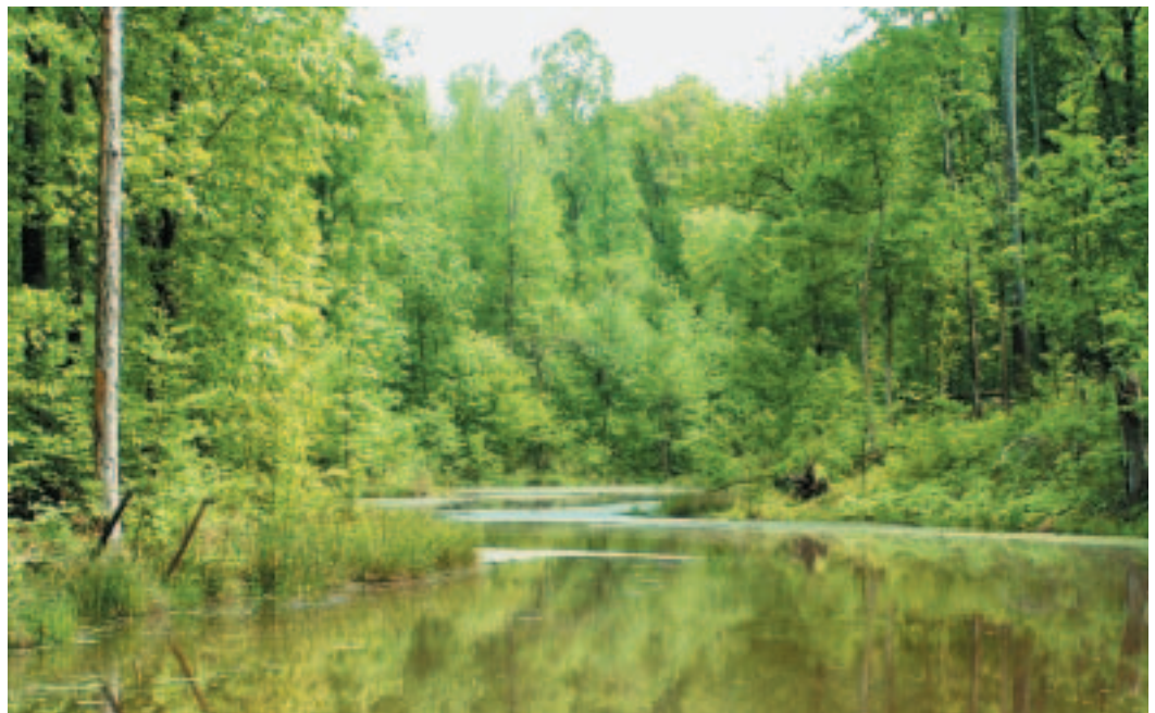
JUST ONE OF MANY MAGNIFICENT VIEWS ACROSS THE MEADOWS PROPERTY.