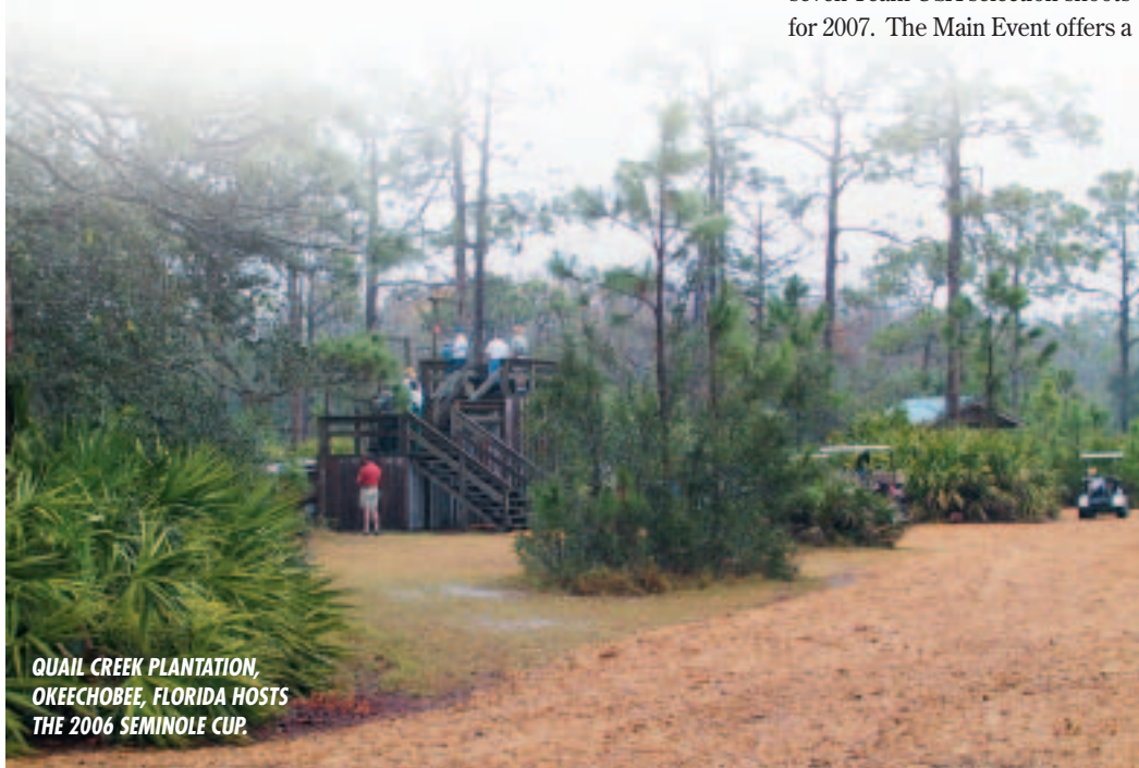
QUAIL CREEK PLANTATION, OKEECHOBEE, FLORIDA HOSTS THE 2006 SEMINOLE CUP.