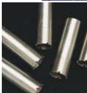
BRILEY THIN WALL CHOKES ARE AN OPTION.

which typically come in the weight range 1500-1600 grams (3.3 to 3.5 lbs), and you can specify your preferred weight to within around 20 grams or so. In a standard sporter weighing 8-8½ lbs, these relatively light barrels lead to a neutral weight distribution and guns that feel very 'pointable'. The contrast with some well known mass produced guns and their typically nose heavy balance (a product of thick walled tubes and