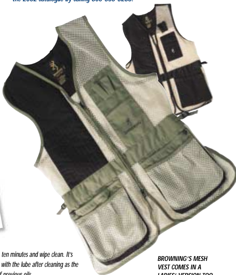
BROWNING'S MESH VEST COMES IN A LADIES' VERSION TOO.

The full Browning range is on show at www.browning.com or you can order the 2002 catalogue by calling 800-333-3288.