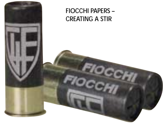
FIOCCHI PAPERS - CREATING A STIR

Another new shell on the market, of Spanish origin, is the ARMUSA range exclusive to E&E Supply of Houston. From a small private company, the Armusa range has some interesting specialty products as well as