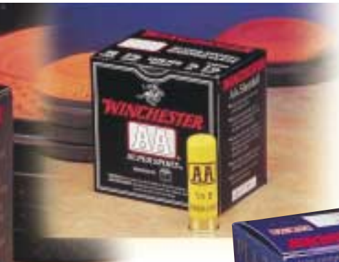
A FULL RANGE FROM ARMUSA