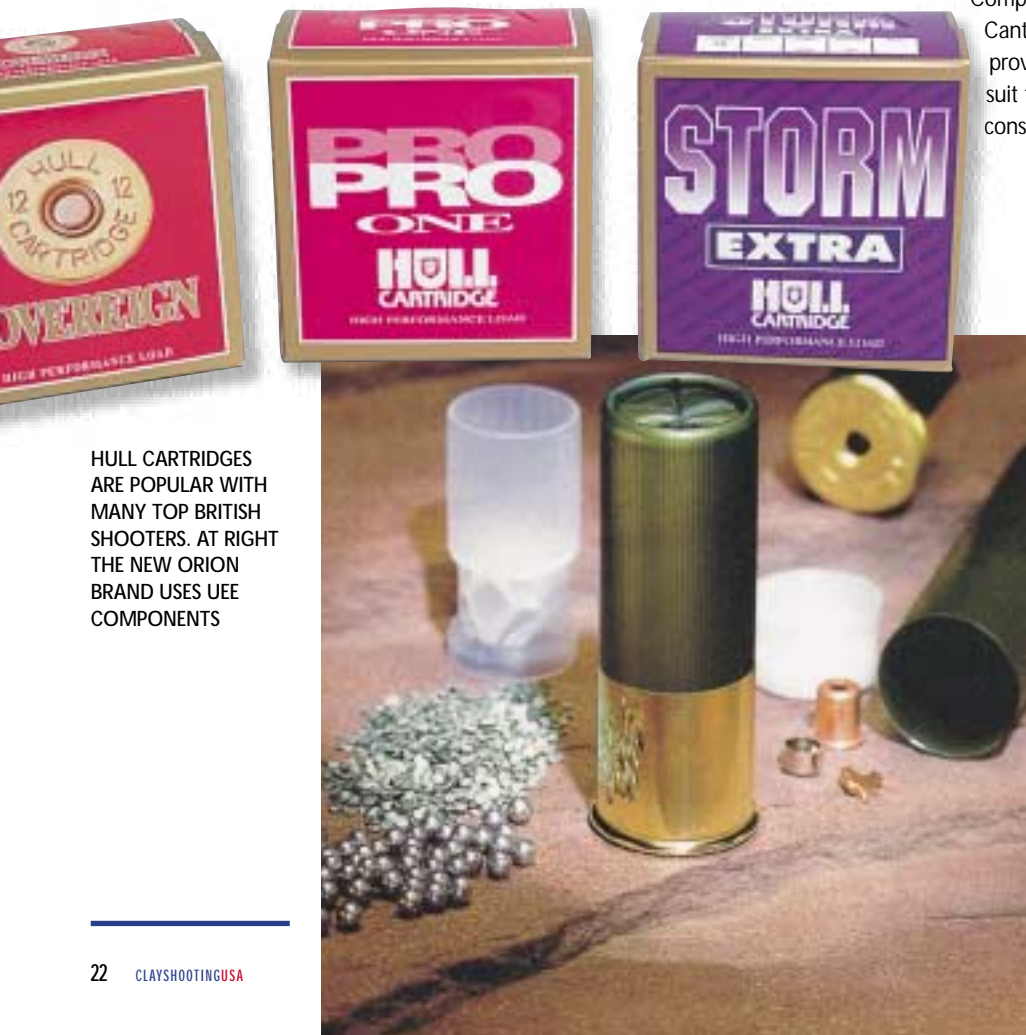
HULL CARTRIDGES ARE POPULAR WITH MANY TOP BRITISH SHOOTERS. AT RIGHT THE NEW ORION BRAND USES UEE COMPONENTS