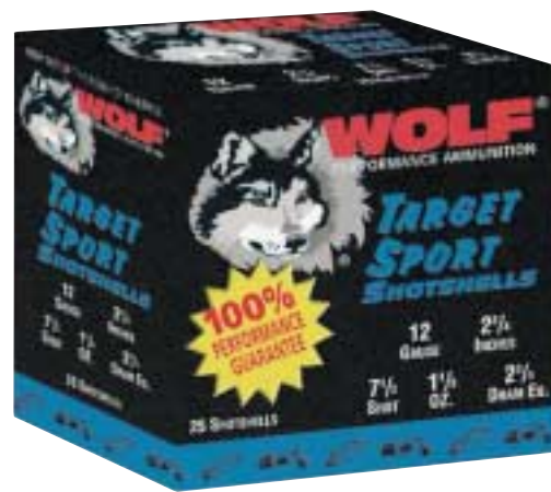
BIG ON VALUE — THE WOLF RANGE