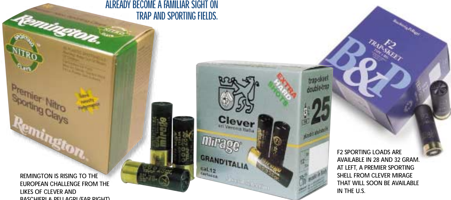
REMINGTON IS RISING TO THE EUROPEAN CHALLENGE FROM THE LIKES OF CLEVER AND BASCHIERI & PELLAGRI (FAR RIGHT)

Strong rivals for patronage are CLEVER MIRAGE , and we learn at press time that they plan to introduce, through Shotgun Shells USA Inc, a range of sporting shells to the US in the near future – including Grand Italia and T2 Competition. From a compact factory on the outskirts of the historic city of Verona, Clever send cartridges all across the globe, with distributors in over 80 countries. We'll keep you posted on news as it develops.