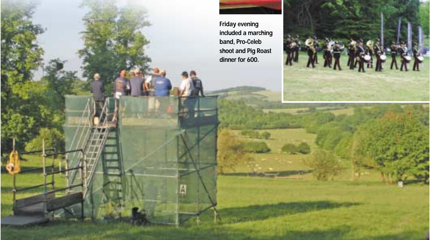
Friday evening included a marching band, Pro-Celeb shoot and Pig Roast dinner for 600.