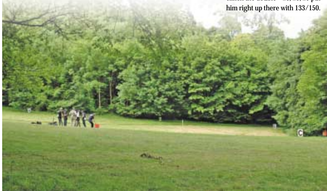
Krieghoff Classic layouts were each very different – using woodland, open pasture and parkland.

Left: A tricky gravity rabbit along the bank on Fox Lodge layout raised a smile or two. Below: Other layouts were shot just under the castle.