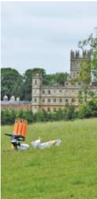
Highclere Castle and its parkland was the most fabulous backdrop to the Parcours de Chasse layouts.