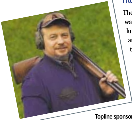
Topline sponsor Vladimir Lisin.