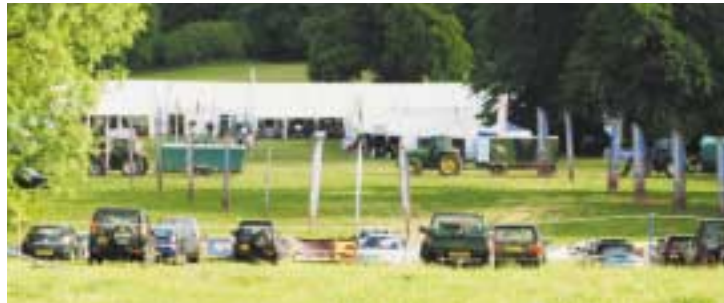
Main picture and Left: Eley Red Course was set high up on the downland with magnificent panoramic views. Below: Friday evening party celebrations.