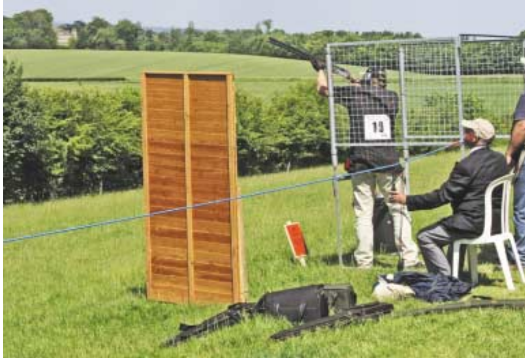
Above and Below: On the open downland, judging target distances – with few reference points – was difficult for most competitors.

was set on high ground overlooking Highclere Castle. Stations one through six were in woodland and seven through fifteen were overlooking miles and miles of open downland. With such a spectacular panoramic view, the distances of battues, teal and standard crossers were difficult to judge, for most, with no reference points. Rain, drizzle and dull conditions on the third and fourth day of this six day competition made it even more difficult to build good scores on this exposed part of the course. As a result, Eley Red shot some 7-8 targets tougher than Eley Blue. Richard Faulds, who shot in perfect conditions on the first day, recorded the highest Red course score of 88. It was tough – very tough!