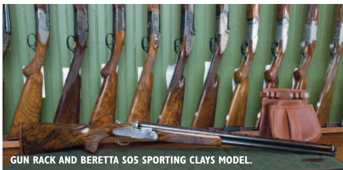
GUN RACK AND BERETTA SO5 SPORTING CLAYS MODEL.

between two leather chairs, balancing the area devoted to the guns with that dedicated to fly fishing. Appealing to the senses and intellect, an ionizing quality in the air stirs the soul.