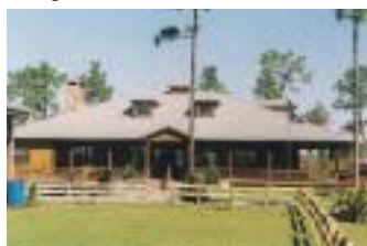
TM RANCH CLUBHOUSE.

Seminole Gun Works, the staff at TM Ranch and the many sponsors. The promise was four days of top competition.