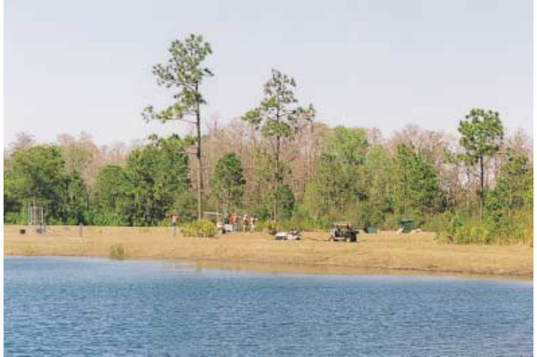
VIEW OF STATIONS 4 AND 5 ON THE ORANGE COURSE.

The variety and styles of targets thrown in the three Pre-lim events earlier in the week led shooters to believe that the Saturday and Sunday Main Event targets would be cranked up a notch or two and prove to be testing – and they certainly were! Distance, speed and angles were used in abundance. Raised shooting platforms, targets over water, the use of scissor lifts and a strong mix of mini, midi, battue and rabbit