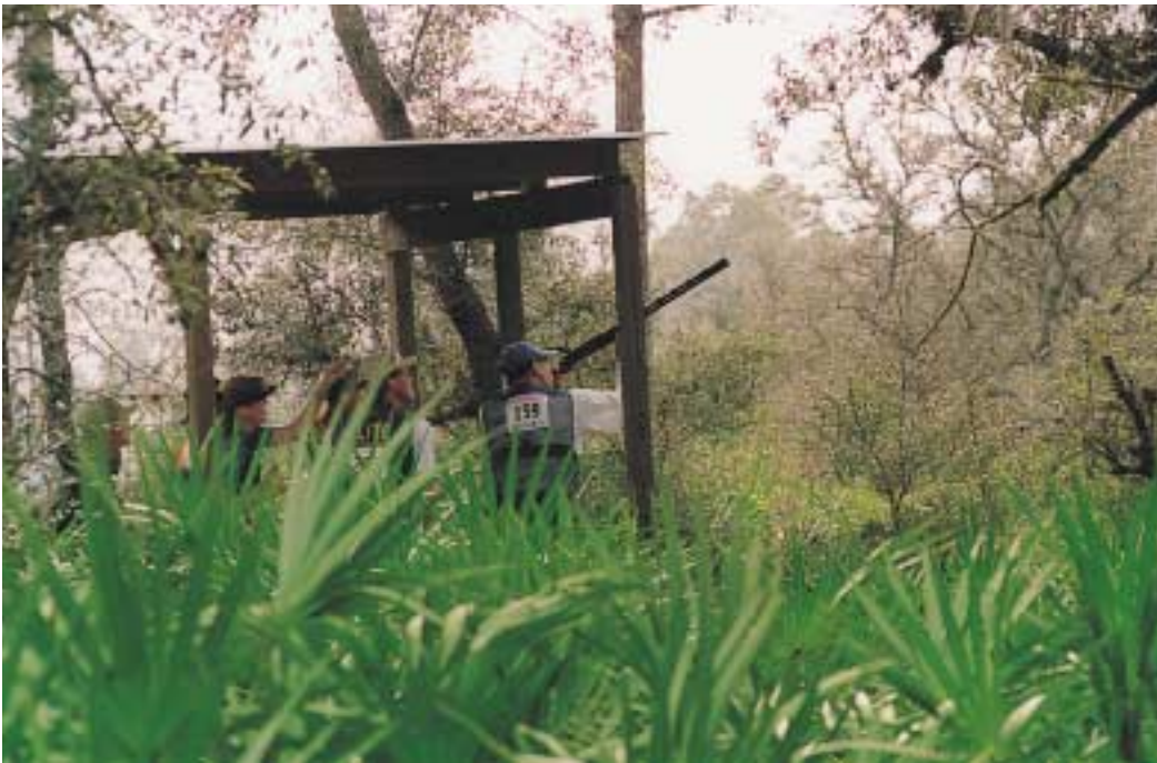
SPECTACULAR VARIETY FROM STATION TO STATION.

But spare a thought for those D and E class shooters that had made the trip in keen anticipation of some competitive sport! The course would certainly have been tough enough without the windy conditions of Saturday afternoon – but with 'floaty' crossers dipping and bobbing in the wind and teal and hanging targets being blown out to 50 and 60 yards or more, the lower classes were to see their Saturday scorecards 'blown' apart