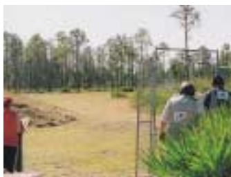
FAST TRAP TARGET ON BLUE COURSE.