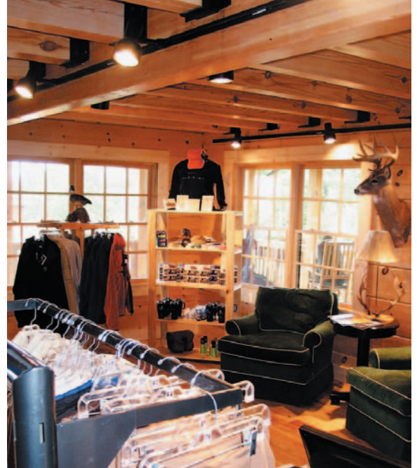
INSIDE THE CLUBHOUSE ARE REST AREAS AND READING AREAS. CLOTHES AND SHOOTING ACCESSORIES CAN BE PURCHASED FROM THE PRO SHOP.

One of the best features of this high profile club is that you can make your own package. So, if you want to have a wedding, a banquet, a shoot for the guests in the afternoon and a reception party in the evening, it's all available at the Homestead. For girlfriends, ladies and wives who do not shoot, there is the Spa. Need I say more? For reservations call 1 (540) 839 1766. ■