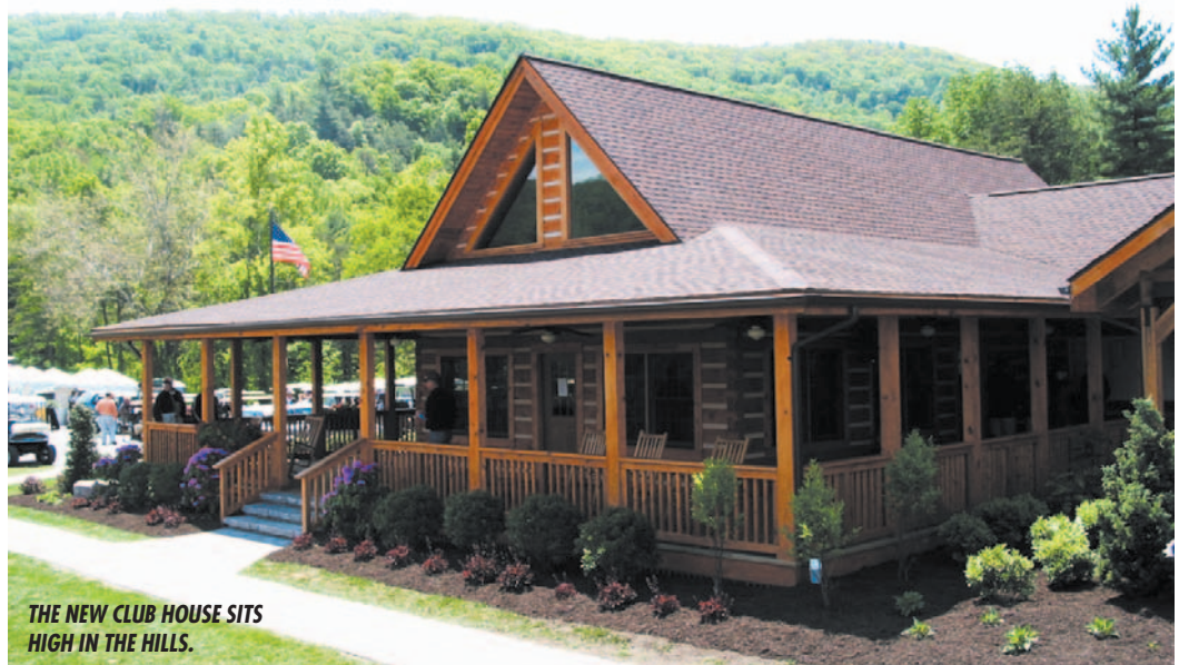
THE NEW CLUB HOUSE SITS HIGH IN THE HILLS.

The shooting club is listed as one of the Homesteads many activities. Set deep in the Allegheny mountains, in the Shenandoah Valley, it has one of