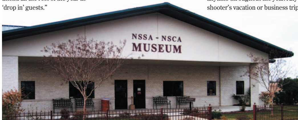
THE NEWEST STRUCTURE ON THE GROUNDS OF THE NATIONAL SHOOTING COMPLEX HOUSES THE NSSA/NSCA MUSEUM.

ammunition developments... there, the many twists and turns in traps... over in that case a look at reloading devices from a century ago to the multi-stage MEC of just a few years ago. An unhurried visit can easily be arranged with NSCA headquarters by calling ahead anytime throughout the year. Any shooter’s vacation or business trip