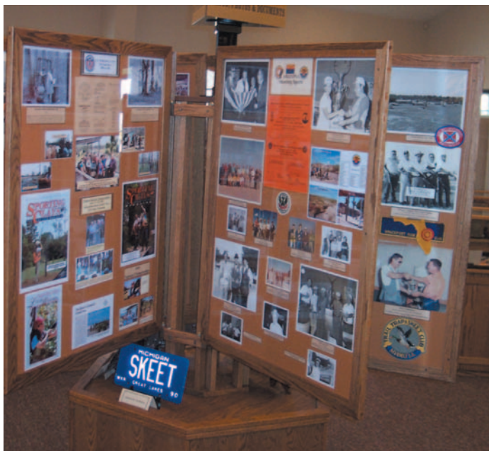
STANDING RACK IN CENTER OF MUSEUM FOR DISPLAY OF PHOTOS. TWO THIRDS OF THE MUSEUM COLLECTION IS OFF DISPLAY... DUE IN PART TO SPACE LIMITATIONS.

...MOST OF THE MUSEUM'S COLLECTIONS HAVE BEEN DONATED OR LOANED BY SHOOTERS SO THAT OTHERS MAY ENJOY THEM. BRAZZELL KEEPS A WATCHFUL EYE ON E-BAY TO PICK UP RELEVANT ITEMS!