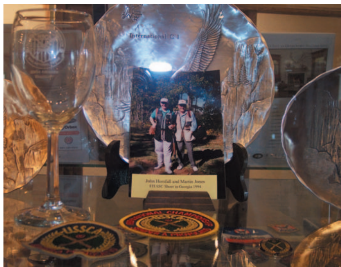
MEMENTOS FROM SHOOT-GONE-BY FILL THE DISPLAY CASES AT THE NSSA/NSCA MUSEUM.