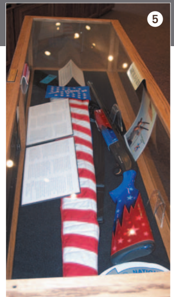
5 GUN AND CASE RAFFLED OFF AT THE 2001 NATIONALS THAT WERE DELAYED DUE TO AIR TRAFFIC DELAYS CAUSED BY TERRORIST ATTACKS OF SEPTEMBER 11, 2001. THE RAFFLE RAISED MONEY FOR THE FAMILIES OF THE PASSENGERS AND CREW OF FLIGHT 93 THAT CRASHED IN PENNSYLVANIA.