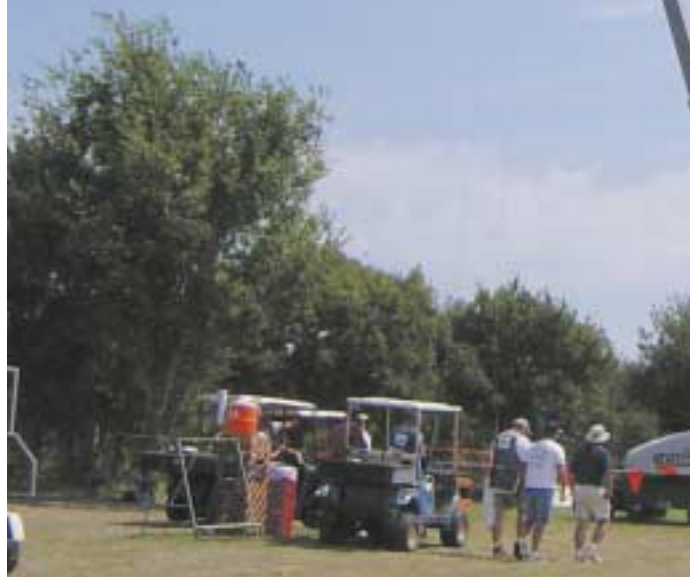
A TRUE PAIR OVERHEAD FROM BEHIND THE SHOOTER WERE PROBABLY THE TOUGHEST TARGETS ON THE ORANGE COURSE.