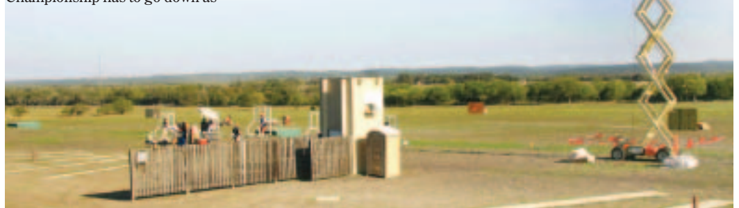
LAYOUT #2 OF THE COMPAK EVENT. ALL FOUR LAYOUTS WERE WELL IN FRONT OF THE SKEET HOUSES AND THE CLEAR BLUE SKIES HELD ON ALL WEEK.

past few years. We can now look forward with renewed interest to see just what new and neat things will be found waiting for the eager competitors at the 2007 National Championship. Nice job and well done to those who made this year’s competition a success! ■