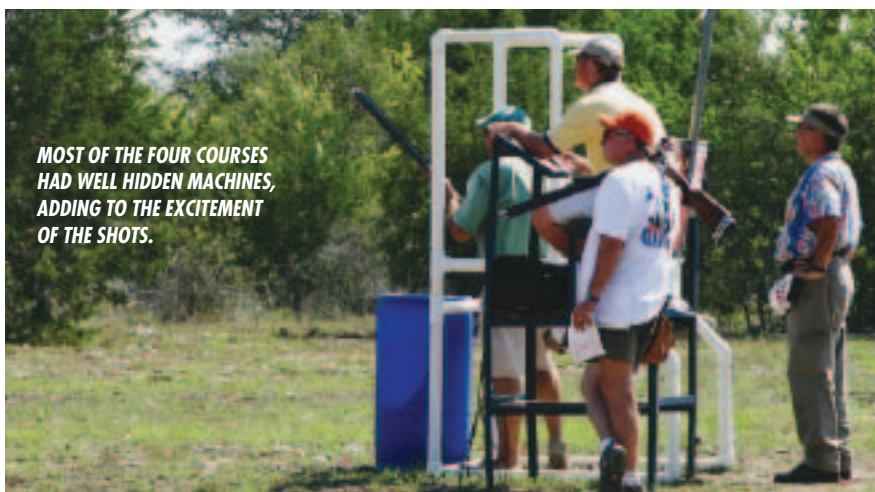
MOST OF THE FOUR COURSES HAD WELL HIDDEN MACHINES, ADDING TO THE EXCITEMENT OF THE SHOTS.

Another point that was suggested for some improvement was the food vending at the main Clubhouse – not because of poor quality, value, or taste, but because there was only one!