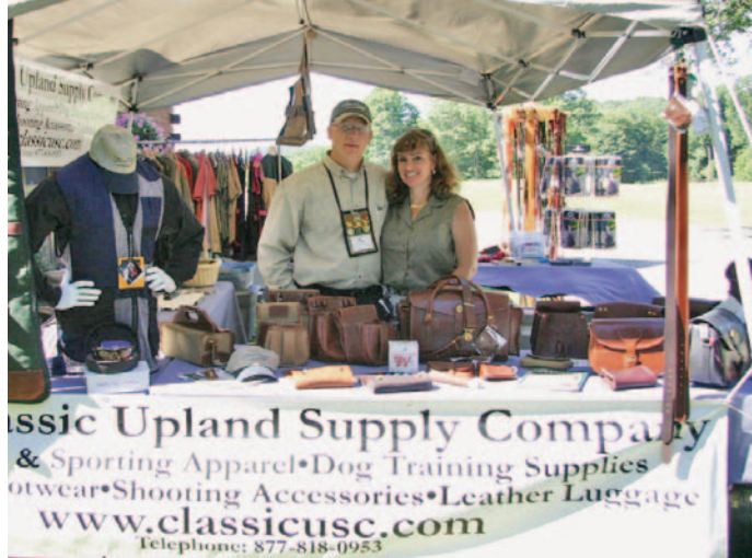
CLASSIC UPLAND SUPPLY CO. WAS ON HAND FOR THE SHOOTERS ACCESSORY NEEDS.

A unique feature of this year's event was the change by the club from using lead ammunition, to requiring all shooters to use 12 gauge shells loaded with Bismuth shot and fiber wads – in keeping with the club's tradition of being a leader in conservation. Two of the local Winchester ammunition rep's were also on hand with sample boxes of Winchester steel target ammunition, in a loading of #7 size steel shot. What was unusual was that the Bismuth shells only