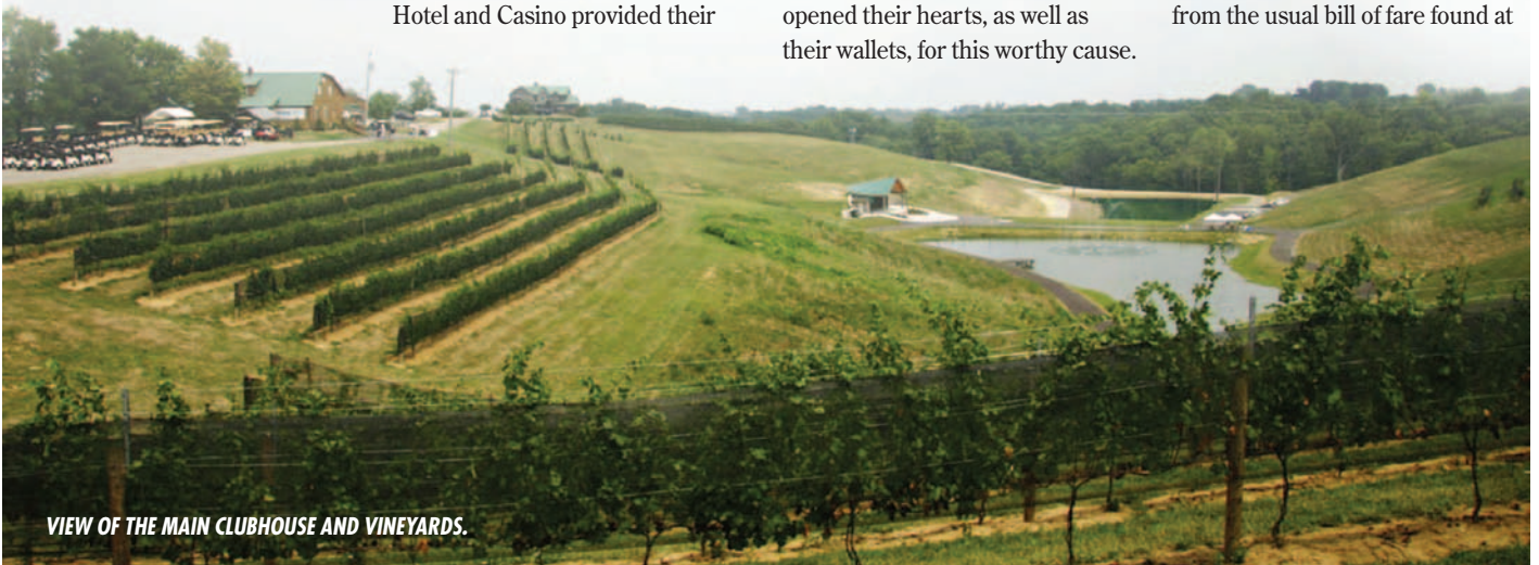
VIEW OF THE MAIN CLUBHOUSE AND VINEYARDS.

The 5-Stand was particularly interesting in format, changed from the usual bill of fare found at