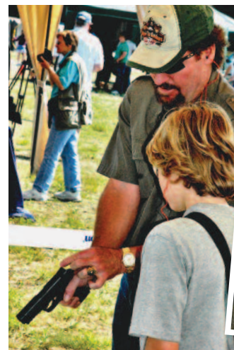
WADE BOGGS WITH YOUNG SHOOTER.