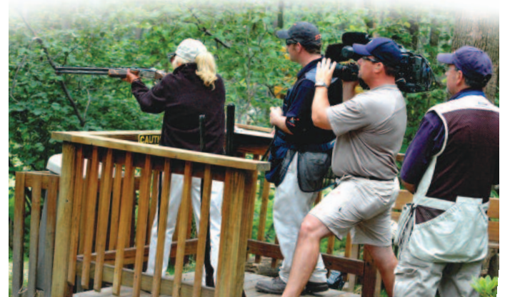
BARBARA MANDRELL AND FILM CREW.