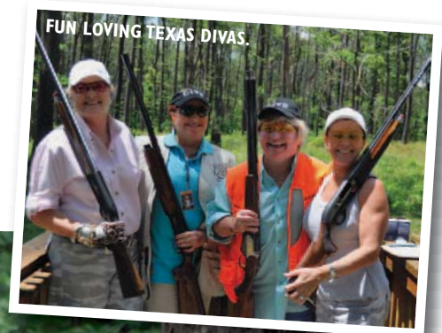
FUN LOVING TEXAS DIVAS.