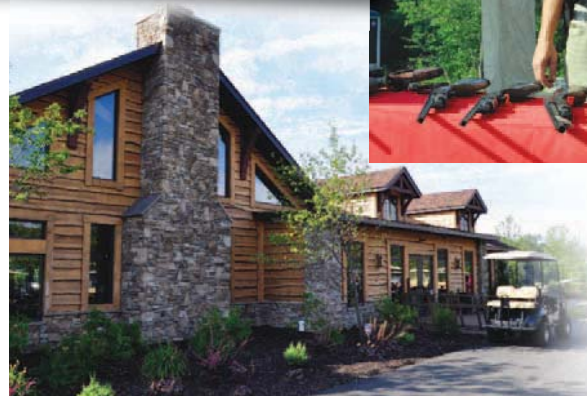
TOP AND RIGHT: VENDORS FROM KRIEGHOFF AND ITHICA. ABOVE: SEVEN SPRINGS CLUB HOUSE. RIGHT: ALL CAUGHT ON CAMERA.