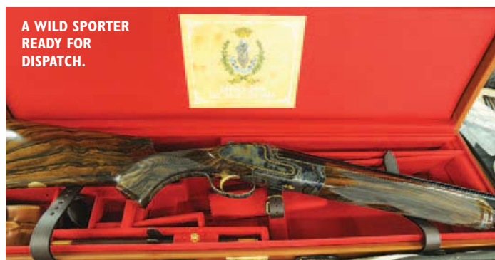
A WILD SPORTER READY FOR DISPATCH.