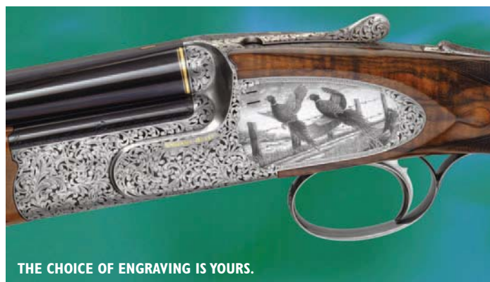
THE CHOICE OF ENGRAVING IS YOURS.