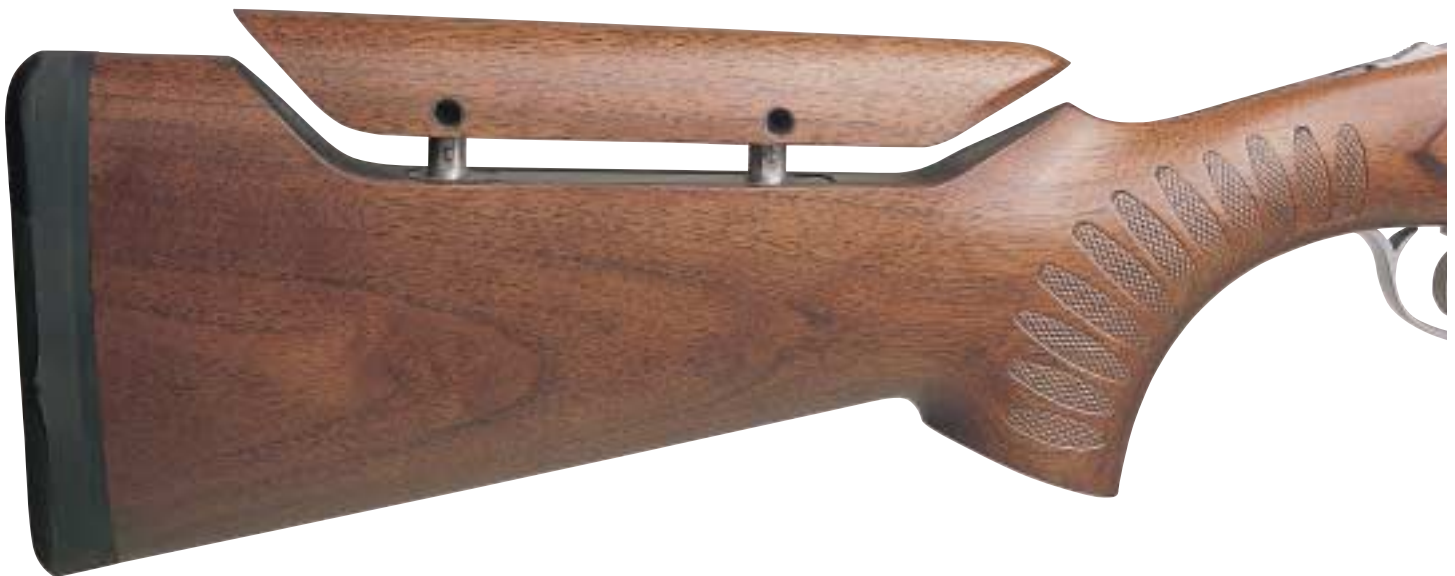
The adjustable comb is a strong selling point in this price bracket.