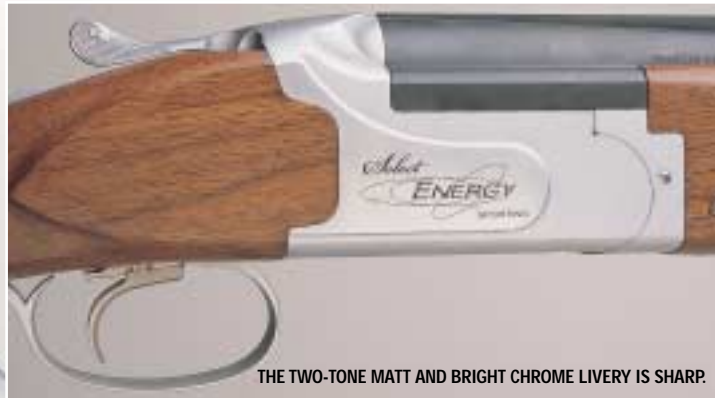
THE TWO-TONE MATT AND BRIGHT CHROME LIVERY IS SHARP.