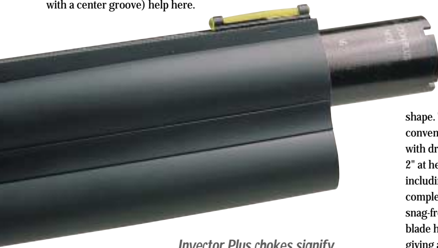
Invector Plus chokes signify overbored barrels. Note the Truglo sight.

THE BIG CHANGE TO THE SELECT COMES FROM A NEW AND LIGHTER BARREL PROFILE, CORRECTING THE BIGGEST PROBLEM WITH THE ORIGINAL DESIGN WHICH WAS NOTORIOUSLY NOSE HEAVY.